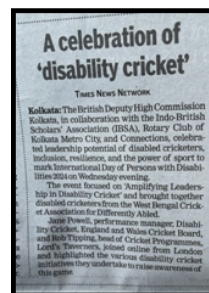
Times of India